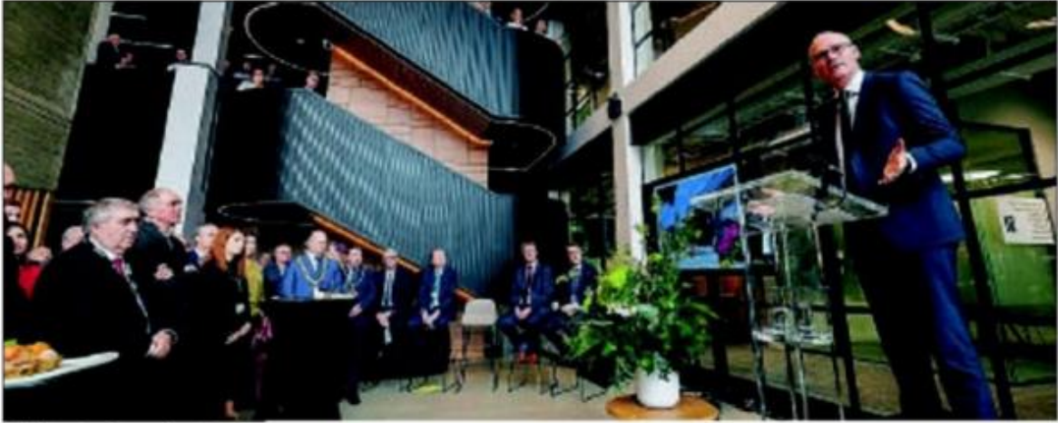
Minister for Enterprise, Trade and Employment Simon Coveney, at the opening of Tirlán's new headquarters and collaborative hub.